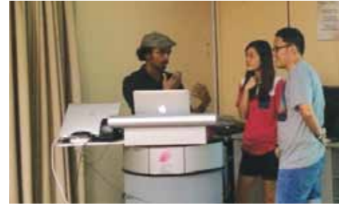
PAS members seeking advice from the expert

The workshop touched on several photography topics: