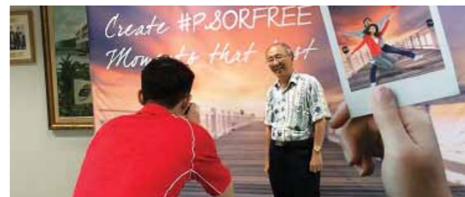
Putting learning into practice at the photo booth

"What I like about photographs is that they capture a moment that's gone forever, impossible to reproduce" - Karl Lagerfeld