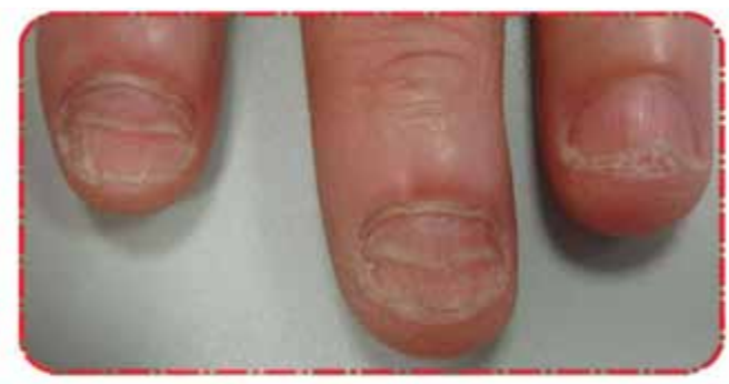
Fig 2A: Patient B – Nail psoriasis

In cases that are more severe and result in significant distress to patients, more advanced options include local photochemotherapy, oral agents such as systemic retinoids, methotrexate or cyclosporine. The oral agents are associated with its respective side effects and close monitoring to detect any of the unwanted side effects are important.