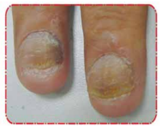
Fig 1A: Patient A - Nail psoriasis

Psoriatic nail changes is commonly associated with cutaneous disease and is found in up to 55% of patients with psoriasis. Some forms are particularly destructive and incapacitating, and many lead to a degree of functional or social handicap. There are a wide range of treatments that has been tried and assessed with respect to their benefit to the nails, independent of effects on disease at other sites