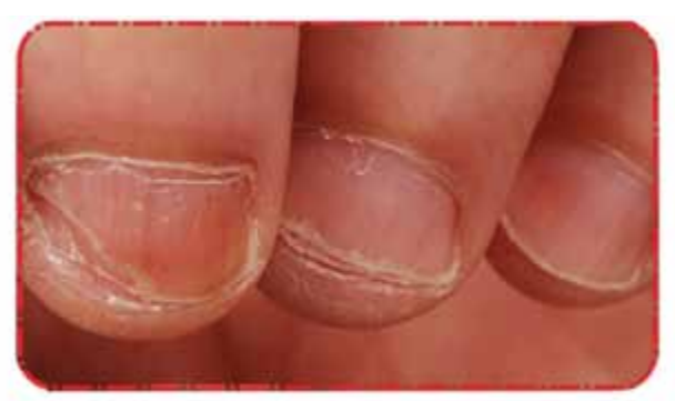
Fig 2B: Patient B – After 2 treatments of intralesional injections

In patients who are not keen for oral agents in view of the associated potential side effects, another alternative is intralesional steroid injections. This method entails regular intralesional steroid (e.g. triamcinolone) injections into the nailfolds of the affected digit of the patient. Up to 4 digits can be treated at one setting and the treatments are usually repeated on a monthly interval. Improvement in the appearance of the nails after a series of injections may be remarkable in some patients. Figures 1A and 1B shows the improvement in a patient's fingernails 2 months after a single treatment of intralesional injections. Figures 2A and 2B shows the result after 2 treatments of intralesional injections in a different patient. As pain during the injections may be a limiting factor, a digital block is employed to anaesthesize the area. This entails injecting a local anaesthetic (lignocaine 1%) into the sides of the digit to be treated. Employing this method usually results in a painless treat-ment session for the patient.